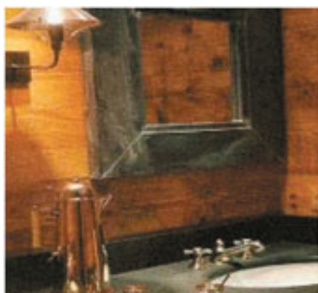
Wood and slate for the bathroom