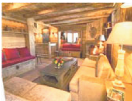
Antiquated wooden ceilings (beams and joists)