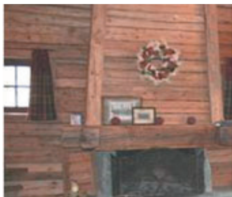
A fireplace in each apartment