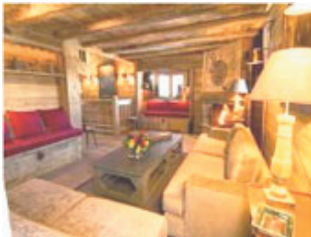
Antiquated wooden ceilings (beams and joists)