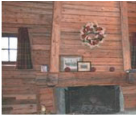
A fireplace in each apartment