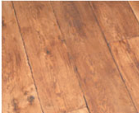
Antiquated solid oak wooden floors (22 cm thick)